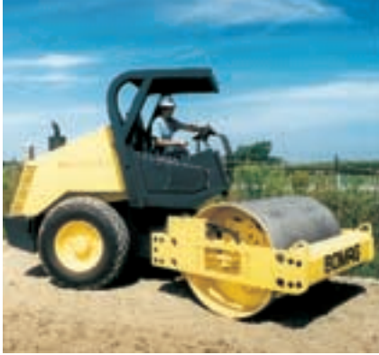
BW177DH-3 – proven compaction performance for medium-sized projects

High compaction performance ensures greater productivity and better profits