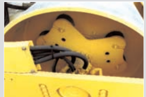
Efficient direct drum drive

With these features and many more, it's easy to see why these models maintain a high residual value while delivering lower lifetime operating costs.