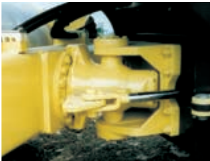
Bolt-on oscillating, articulation joint for long life and servicing ease

High compaction performance ensures greater productivity and better profits