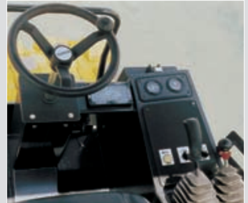
Excellent all-round visibility and ergonomic control layout