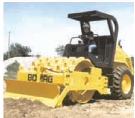
The BW177PDH-3 provides enhanced gradeability on cohesive soil applications