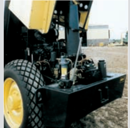
Wide opening hood provides easy access to all components